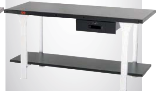
STEEL TOP WORK BENCHES WITH ONE DRAWER

Steel top workbenches with one lockable drawer.