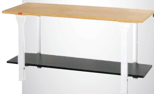
WOODEN TOP WORK BENCH