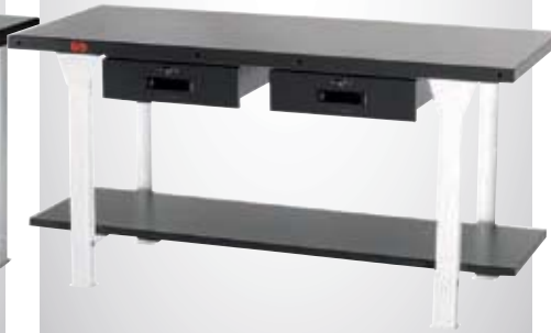
STEEL TOP WORK BENCHES WITH TWO DRAWERS

Steel top workbenches with two lockable drawers.