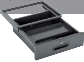
DRAWER FOR WORK BENCH