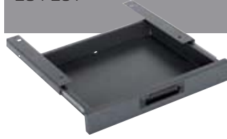
DRAWER FOR SERVICE TROLLEY