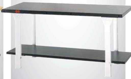
STEEL TOP WORK BENCHES