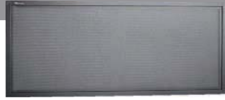
PERFORATED PANELS FOR TOOL ORGANISATION

Perforated panel for fitting hooks and other tool hanging accessories. Strong steel frame with two wall brackets.