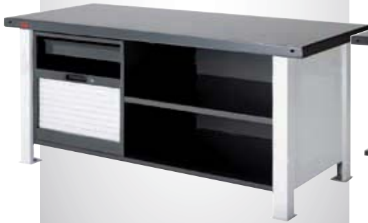
HEAVY DUTY WORK BENCH

Very robust all steel construction and epoxy coated finish. Includes one module with lockable shutter with one drawer, divided in 16 compartments, and one additional module with one shelf with large load capacity.