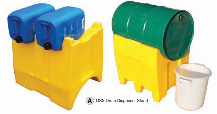
A DSS Drum Dispenser Stand